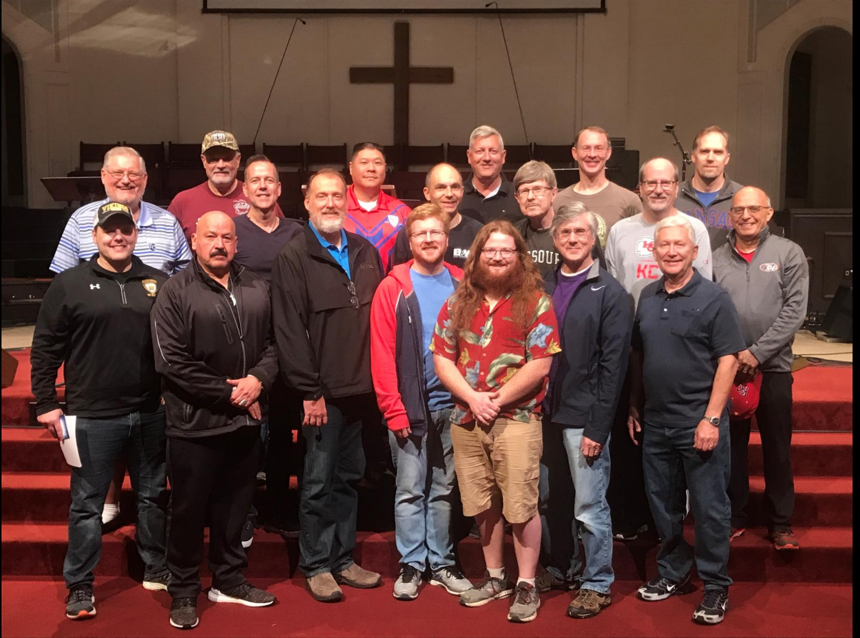
The Deacons of EBC